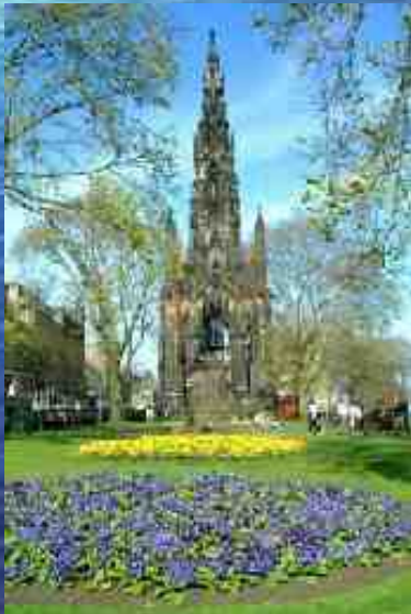
Sir Walter Scott Monument