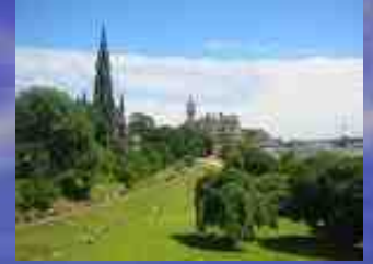
Princes Street Gardens